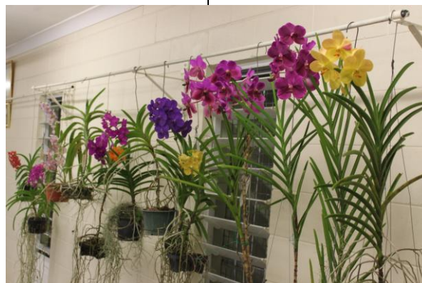
Figure 1: some of the orchids tabled at the 24th February meeting.

Min will be sadly missed by all and we extend our sincere condolences to Peter and family members.